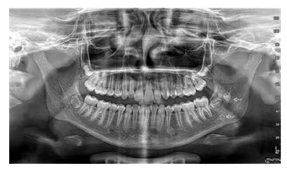
Figure 2. OPG image showing two highly saturated lesions in the left masseter muscle (white arrows)