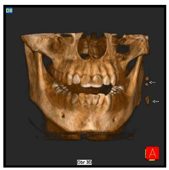
Figure 3. CBCT image showing two highly saturated lesions located near the left mandibular angle (white arrows)

foci of calcification and central necrosis (Figure 4). After excluding calcium disorders, a diagnosis indicating calcifications of the dystrophic type of the masseter muscle was made.